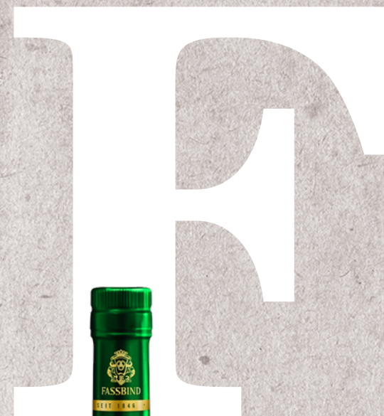
Fassbind Vieille Poire Old Pear

Swiss fine spirits Fassbind have been well-known for their quality for decades. They have a characteristic clear and full-bodied flavour. Vieille Poire is made with ripe Williams pears. After distillation, it is stored in oak barrels followed by 12 to 18 months of maturing. The resulting spirit is refined with a natural dried William pear extract that provides this multi-award fruit brandy with a delicately elegant sweet flavour with intense pear notes.