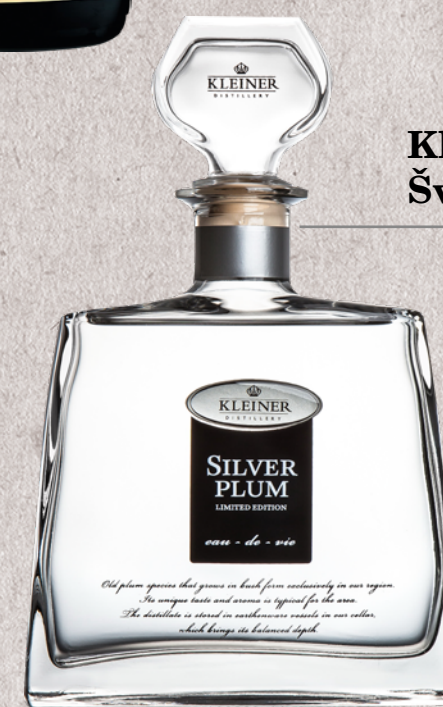
Kleiner Silver Plum Švestka Kulatka

Kleiner Distillery located in Žešov near Prostějov fairly ranks among the best national fruit spirit producers. It is a small family company with a "quality first" philosophy. Everything from fruit harvesting to bottling is done by hand and exclusively in small batches. The plum spirit Silver Plum is made from an old local variety of wild blue plums called Kulatka. After double distillation, Silver Plum is stored in earthenware containers away from the sunlight securing its balanced deepness.