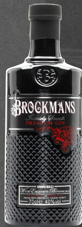
Gin Brockmans London Dry

The goal of Brockmans owners was to create a gin that would be unprecedented. The selection of botanicals used for the production includes juniper, blueberries, blackberries, cassia bark, liquorice, lemon peel, coriander, angelica root, orange peel, almond, and orris root. The outcoming gin has distinct notes of juniper and coriander combined with juicy notes of blueberries and blackberries.