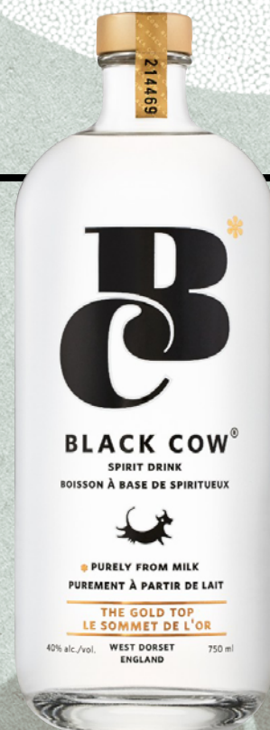
Black Cow Pure Milk