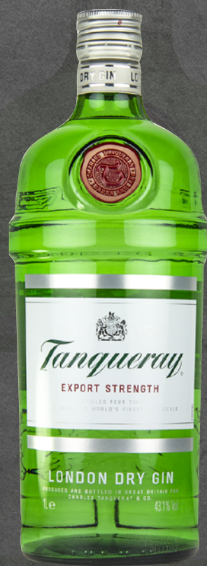
Gin Tanqueray London Dry

Original London Dry. Tanqueray uses only four botanical ingredients: juniper, coriander seed, angelica root, and liquorice. The result is the purest variety of the original London Dry gin with a perfect balance between taste and aroma. An interesting fact - some people mistakenly believe that the bottle design was inspired by a fire hydrant. The truth is that the bottle was designed to resemble a three-piece cocktail shaker.