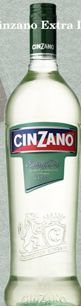
Cinzano Extra Dry

Vermouth Cinzano does not contain any aromatic substances or artificial dyes. Cinzano Extra Dry is pleasantly dry with a light-yellow colour. It bursts with flavours brightened up by characteristic hints of aromatic herbs. It is round, easygoing, and tempting.