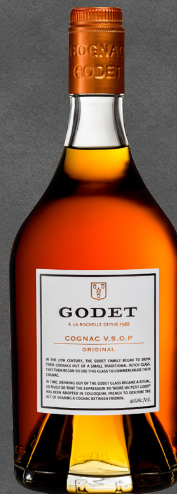
Godet Selection Speciale V.S.O.P.

It is made from 10 year old cognacs Fins Bois, Borderies, and Petite Champagne. Mature cognac with a slight touch of wood and flavours of hazelnuts, stewed peaches, and red fruits.