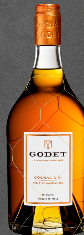
Cognac Godet XO Fine Champagne

Godet XO Fine Champagne is a finely balanced blend of 35 year old cognacs. It is made from grapes from Grande Champagne and Petite Champagne regions. Aromas of roses and violets are followed by a light fruity taste of peaches and strawberries. It was voted the best XO cognac in 2013.