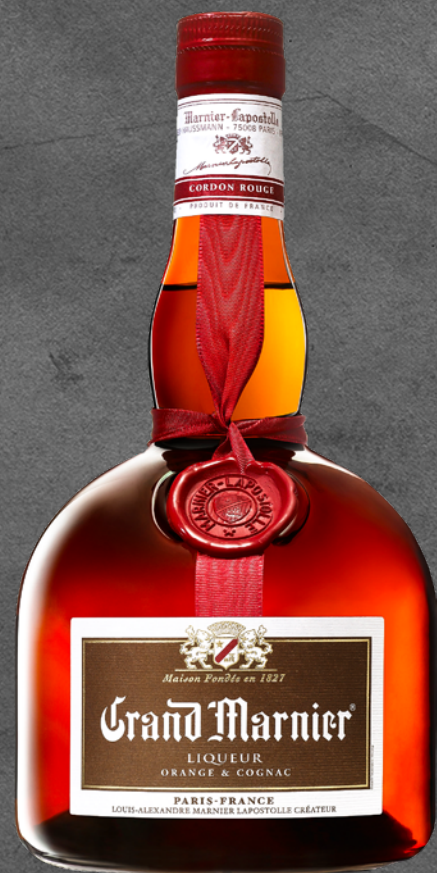
Grand Marnier Gordon Rouge

Liqueurs are sweetened and flavoured spirits. They were originally invented in apothecaries, monasteries, and alchemists' workshops in the middle ages. The first trustworthy note by Lucas Bols is dated back to 1575. It was a way how medieval monks tried to refresh exhausted pilgrims. The cradle of liqueurs is Italy with its harbours importing spices from all over the world that were further transported to the rest of Europe.