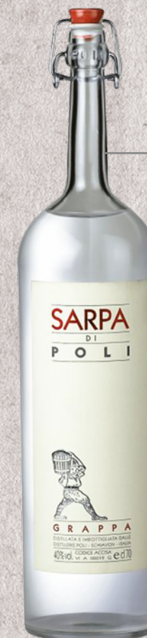
Grappa Sarpa di Poli

Fruit spirit is a fine spirit that is made from distilled fermented mash prepared from crushed fruits or other parts of plants. It obtains its characteristic aroma from the fruits or other ingredients that were used for the preparation